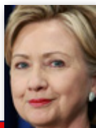
Hillary Clinton (D)